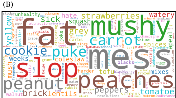
Figure 2: Word cloud for terms in the user judgment: (A): judgments for attractive images, (B): judgments for unattractive images.